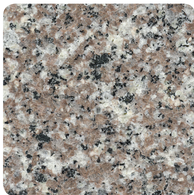
description: GRANITE series/style: NATURAL STONE color: BURLYWOOD size: 2CM