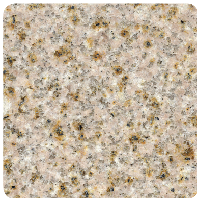
description: GRANITE series/style: NATURAL STONE color: WHEAT size: 2CM