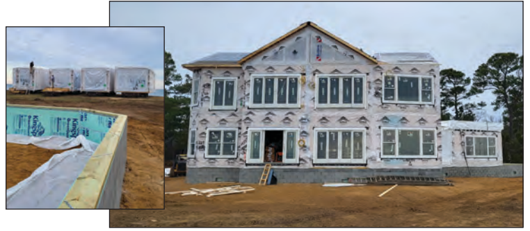
One day after completion of foundation.